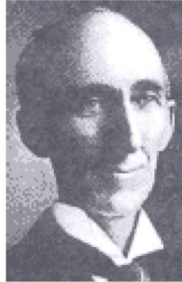
Wallace D. Wattles